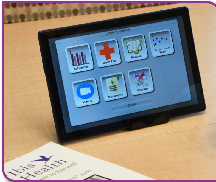
The Ibis Tablet displays large, clear icons for easy navigation.

months, and it is easy to use. It is a good thing, especially now that Granite VNA is not visiting anymore."